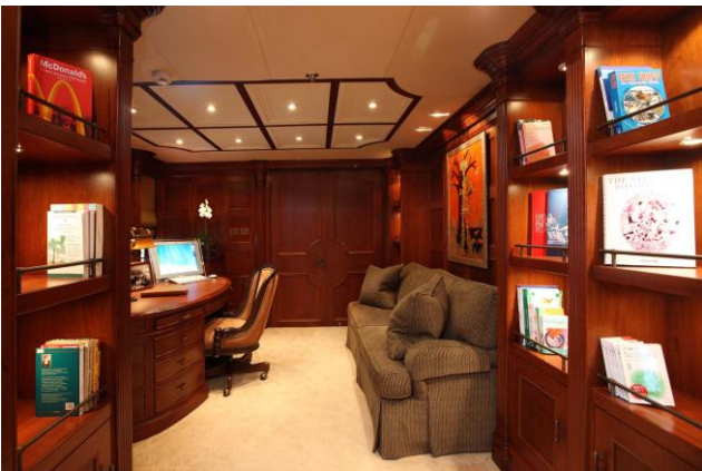
Master Stateroom computer