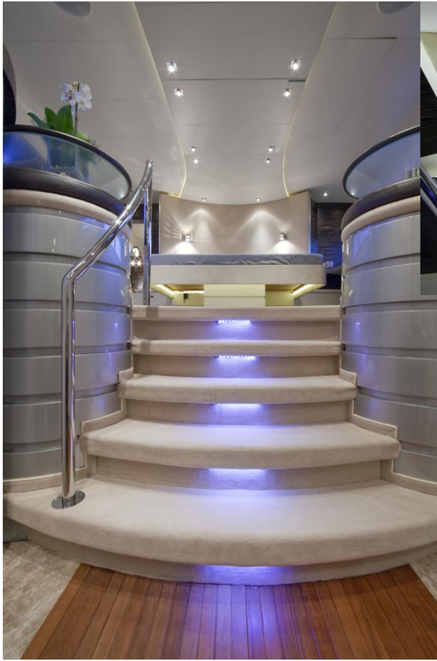
Master stateroom stairs