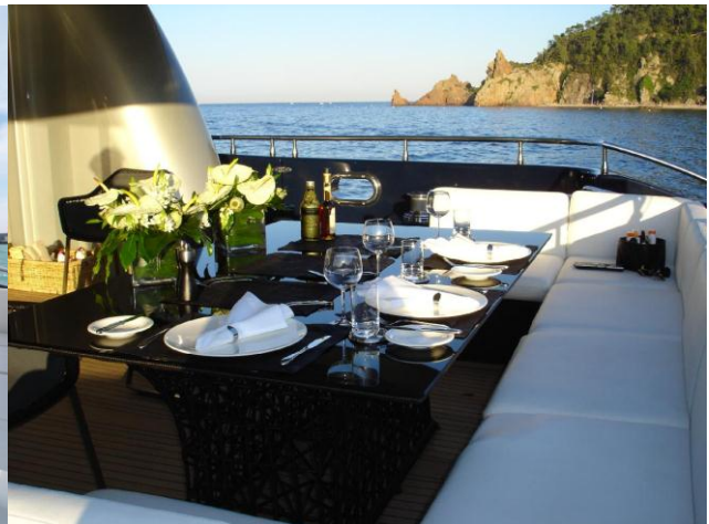
Aft deck dining