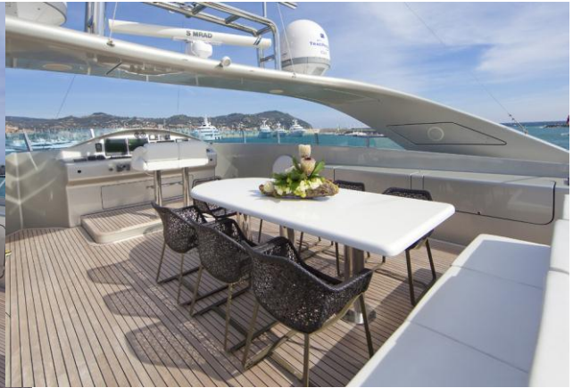
Sundeck dining area