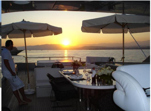
Sundeck dining b