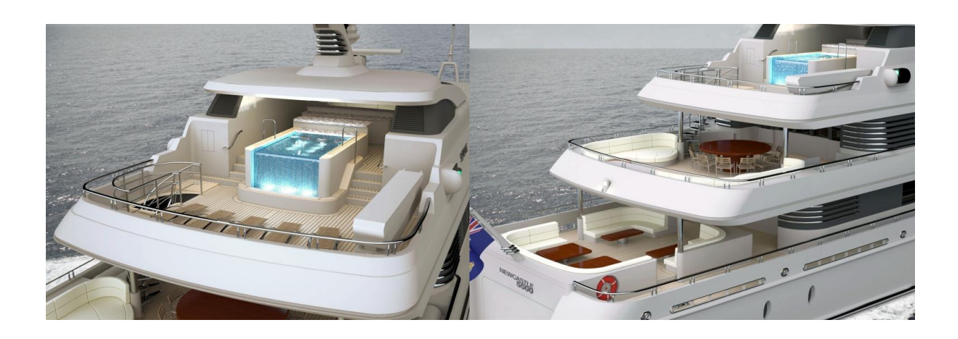
Jacuzzi / infinity pool on sundeck