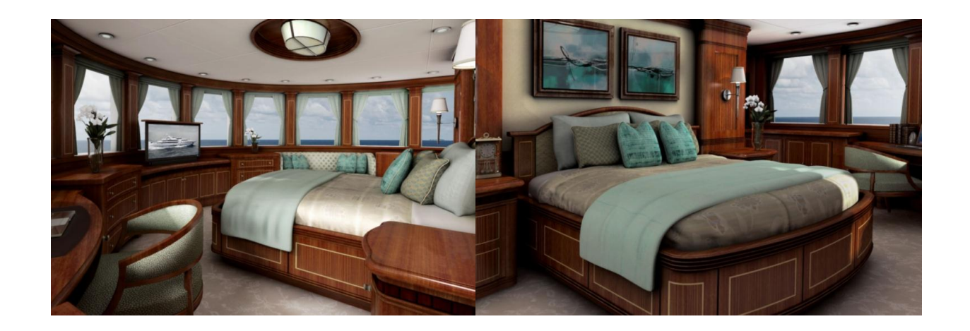
VIP master on skylounge deck foward