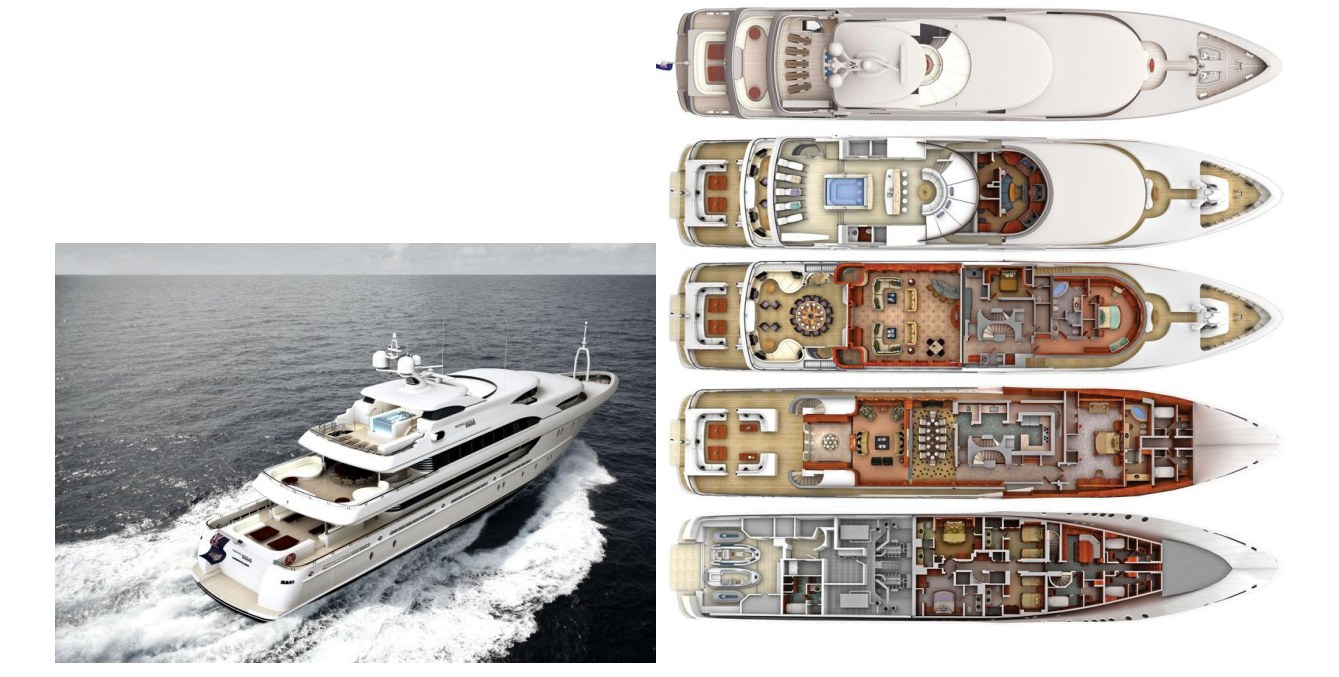
3D-skylounge aft deck