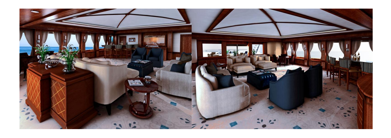
Skylounge view forward