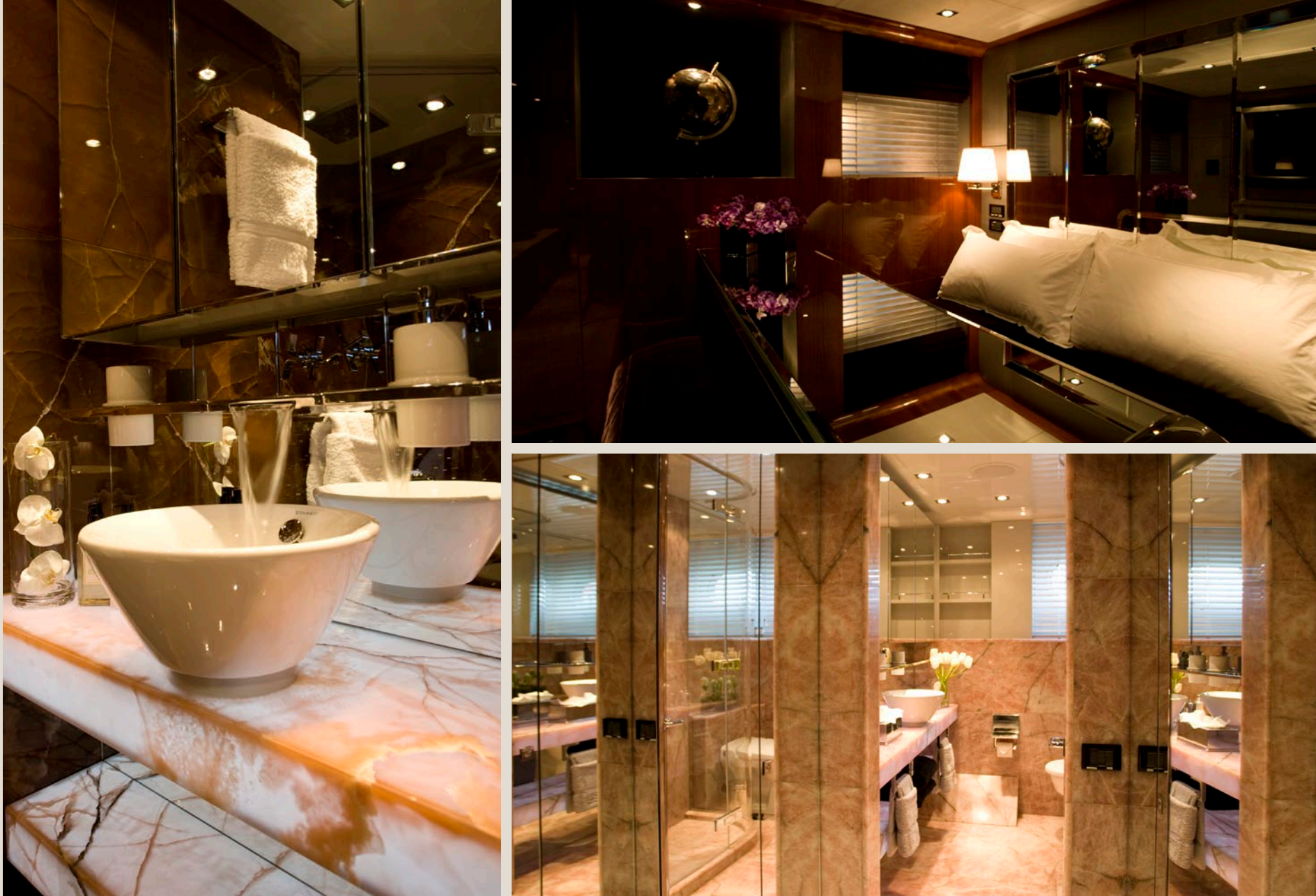
The three double cabins and a bunk room perfect for children each have different colour schemes executed in exotic wall coverings, and are extremely soundproof.