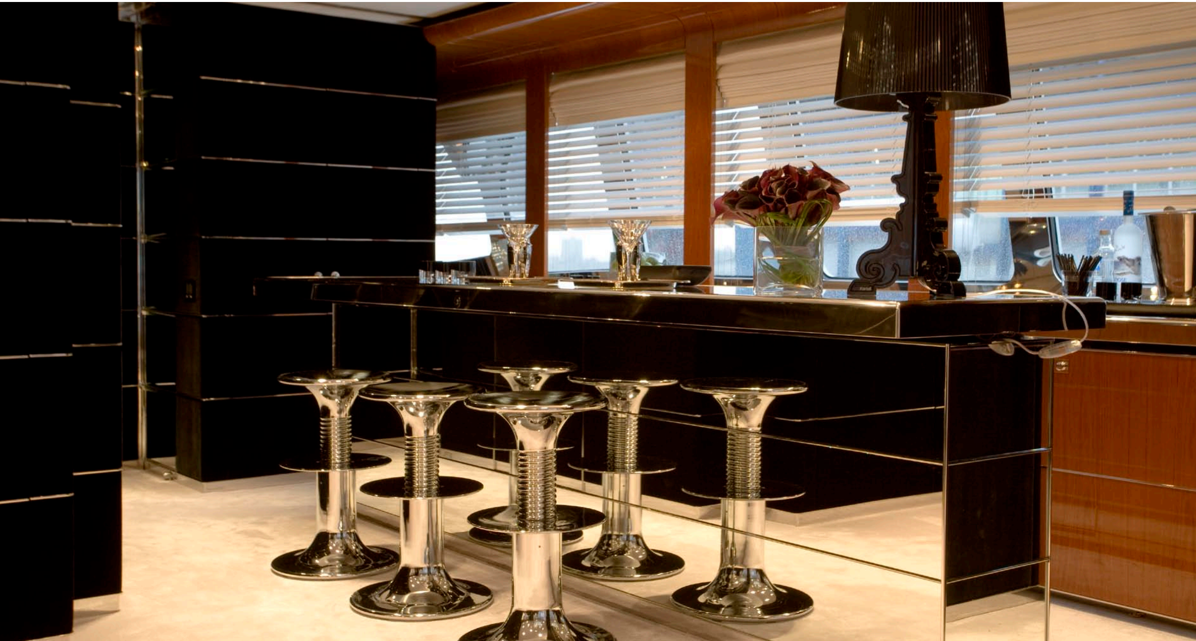
The long, mirrored bar and mirror insets between the windows cleverly provide an uninterrupted view. The upper Saloon can also be used as an extra guest cabin.

Bespoke items of furniture... A unique finish.